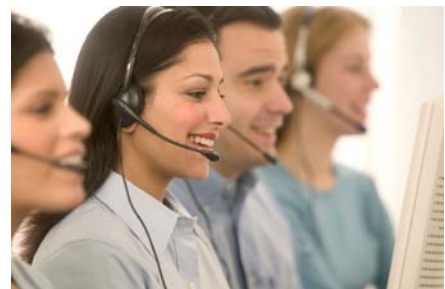
Call center call handling directly from your desktop.

is a application add-on for supervisors that allows management of call center activity from the computer desktop. The application is easy to